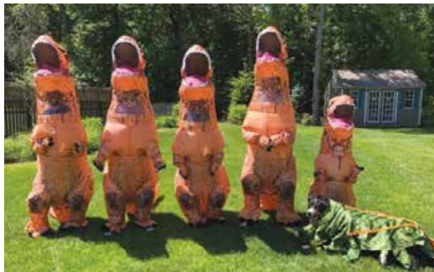
BAER and the T-Rex family

We always enjoy hearing from BERNER Inc. adopters about their lives with their Berners (and their other dogs, cats, alpacas, goats, birds, rabbits—all animals).