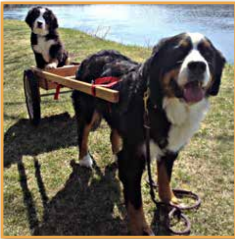
Reiki & daughter Porschia practicing drafting. —Celeste O'Malley; Brattleboro, VT