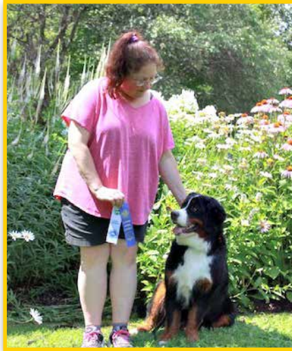
USHER HILLSIDE DREAM ON CGC, TKN (Betty Boop) passed her Canine Good Citizen Test and the Novice Trick Dog test in 2019.